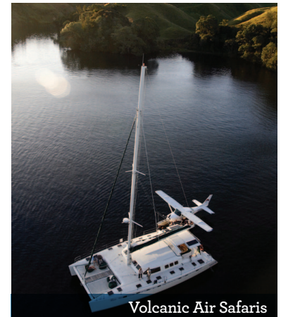
Volcanic Air Safaris

Cruise the Lake In the afternoon, charter the luxurious 53 foot catamaran Tuia, operated by Pure Cruise New Zealand. Sail across beautiful Lake Rotoiti and enjoy a soak in the lake's natural hot pools that are only accessible by boat. Back at shore enjoy a feast of fine cuisine and premium New Zealand wines while taking in the lake surroundings.